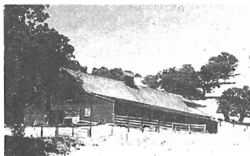
The Schultz Barn